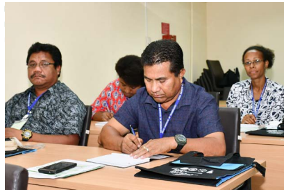
Training on Management of Parasitic Diseases in Aquaculture 26-30 November 2018