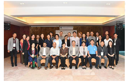
Future of Graduate Education in Sustainable Development: Fostering the Next Generation of Professionals By Department of Development and Sustainability, AIT 29 November 2018