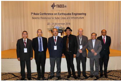
7th Asia Conference on Earthquake Engineering 22 November 2018